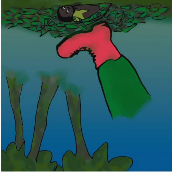
One of the soldiers put his foot right on him, but he kept quiet.