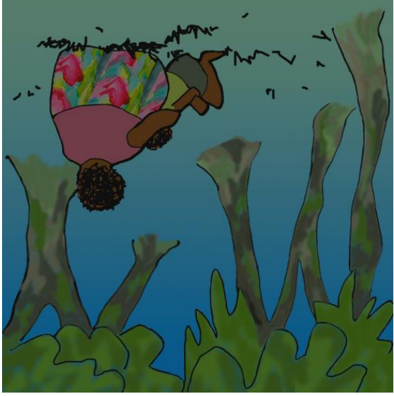
They hid in the bush until night.