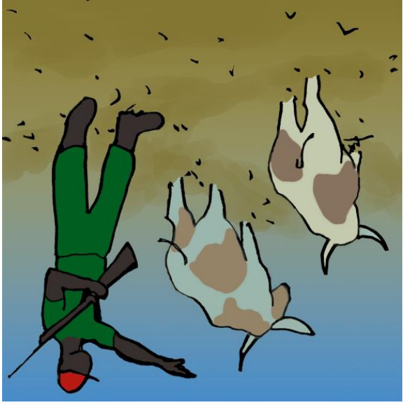
They took the cows away.