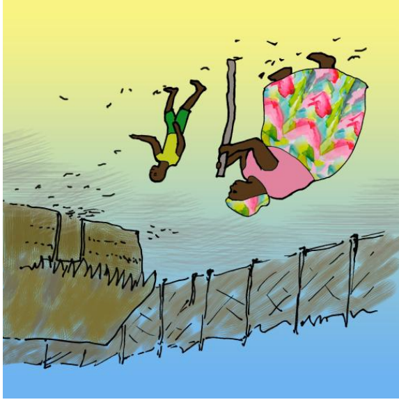
They crept home very quietly.