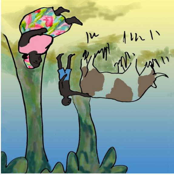
Tingi and the cows