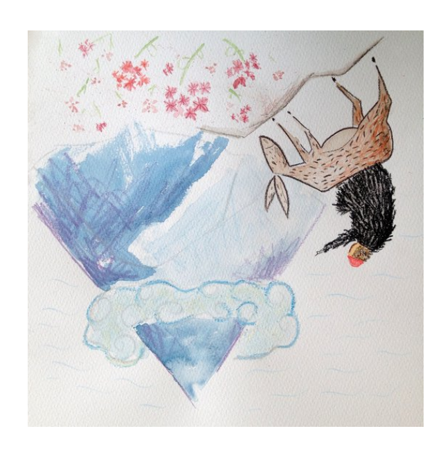
One morning, the old man asked Donkey to carry him to the top of a mountain.