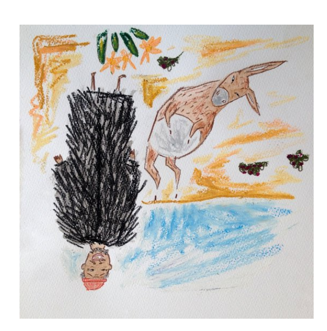
Donkey woke up to find a strange old man staring down at him. He looked into the old man's eyes and started to feel a twinkle of hope.