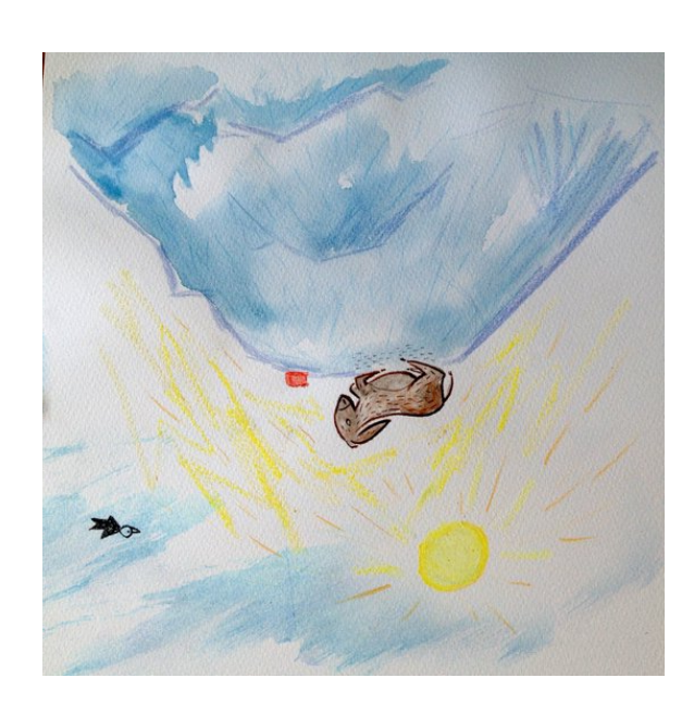
... the clouds had disappeared along with his friend, the old man.