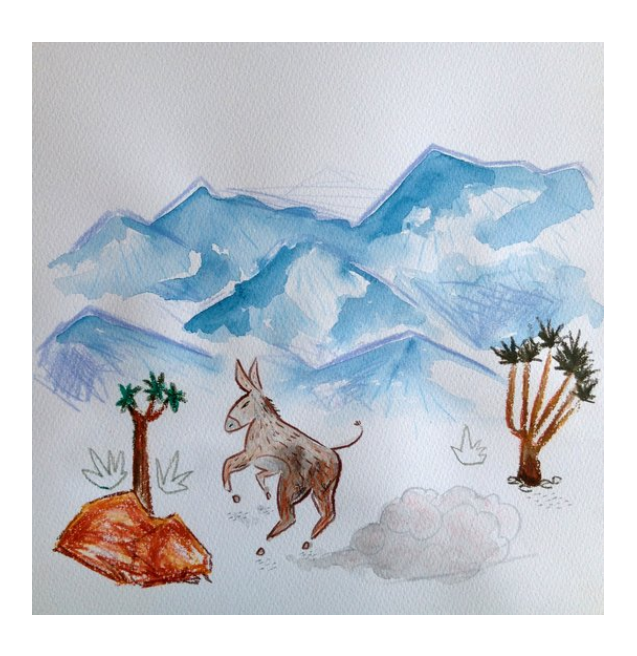
Donkey finally knew what to do.