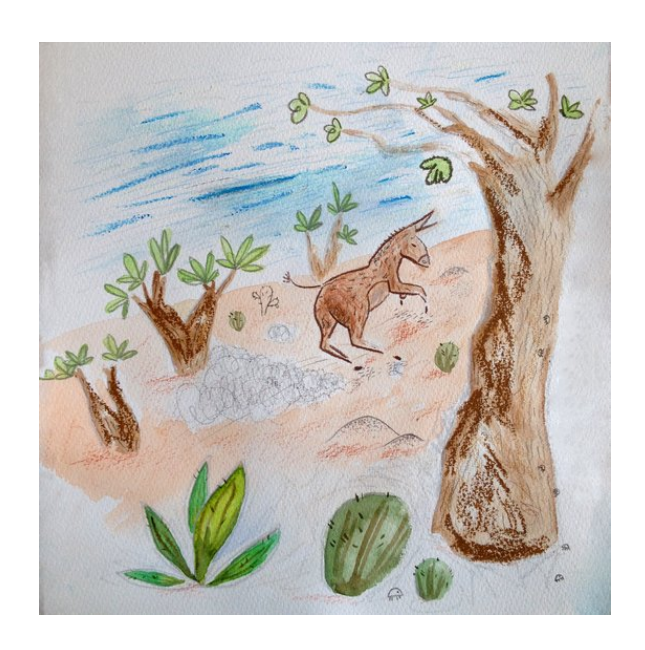
Donkey was filled with shame. He started to run away as far and fast as he could.