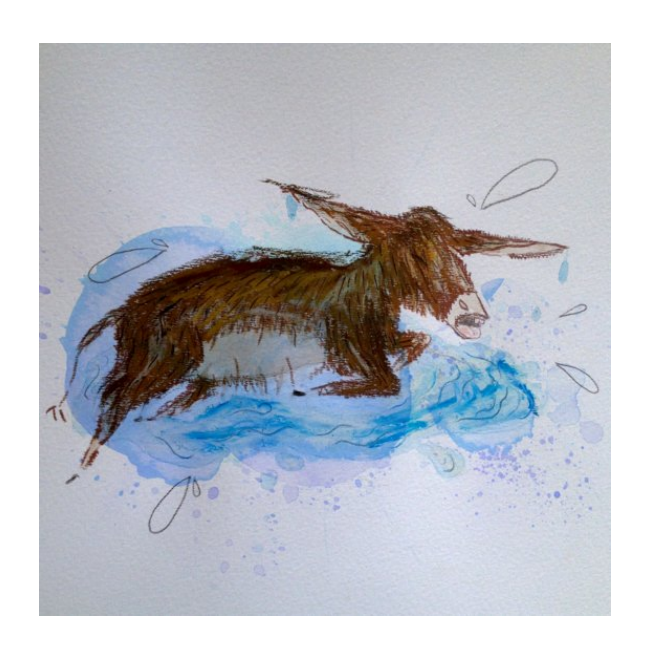
But when they saw the baby, everyone jumped back in shock. "A donkey?!"