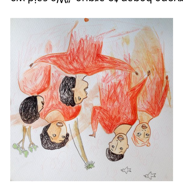
Everyone began to argue. "We said we would keep mother and child safe, and that's what we'll do," said some. "But they will bring us bad luck!" said others.