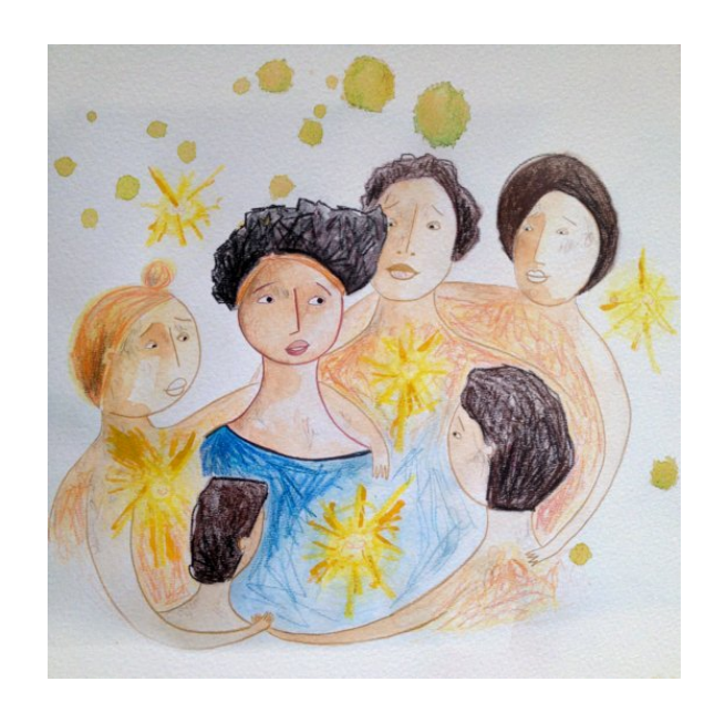
Shy but brave, the little girl moved nearer to the woman. "We must keep her with us," the little girl's people decided. "We'll keep her and her child safe."