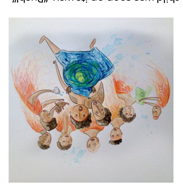
The child was soon on its way. "Push!" "Bring blankets!" "Water!" "Puuuuussssshhh!!!"