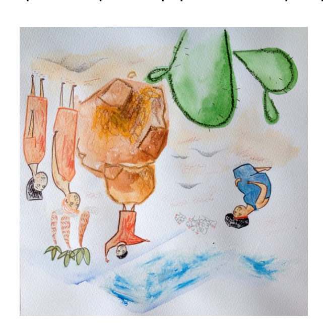
As the shape moved closer, she saw that it was a heavily pregnant woman.