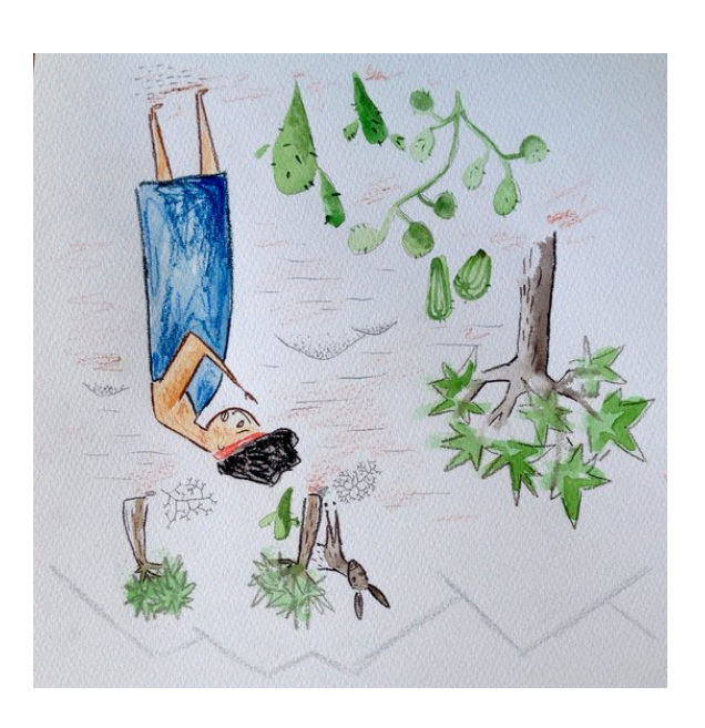
Donkey found his mother, alone and mourning her lost child. They stared at each other for a long time. And then hugged each other very hard.