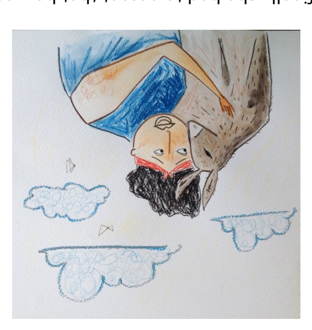
But finally she had to accept that he was her child and she was his mother.