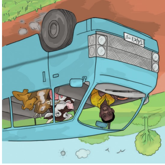
Goat, Dog, and Cow